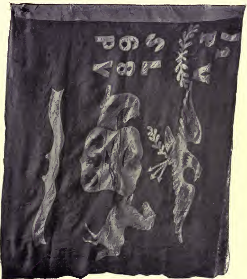
FLAG MADE BY THE PENNSYLVANIA VOLUNTEERS WHILE EN ROUTE TO MEXICO, AND SUBSEQUENTLY USED BY THE "SCOTT LEGION" DURING THE LATE REBELLION.