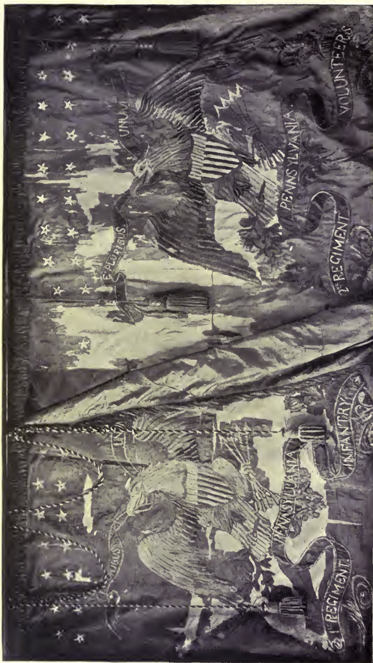
FLAGS PRESENTED TO THE FIRST AND SECOND REGIMENTS, PENNSYLVANIA VOLUNTEERS, BY GENERAL SCOTT, IN THE CITY OF MEXICO.